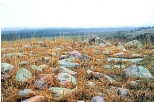
Sioux quartzite on hillside, Wabaunsee County.

Quartzite boulders in Wabaunsee County. —Although boulders of Sioux quartzite are found throughout the Glaciated Region, a hillside in northern Wabaunsee County has more than most places. These quartzite boulders are metamorphic rocks—sandstone that has been metamorphosed into quartzite.