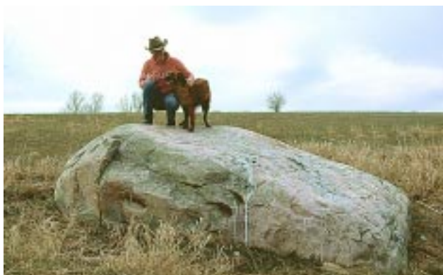
Large quartzite boulder, Marshall County.

Among the glacial erratics in northeastern Kansas, quartzite is one of the most common. Quartzite, a metamorphic rock, is quartz sandstone that is so thoroughly cemented with silica (SiO 2 ) that the rock breaks through the grains as easily as around them. It is harder than sandstone and can not be scratched by a knife. The quartzite boulders in the Glaciated Region are known as Sioux quartzite because they come from the area where Sioux quartzite crops out in the area around Sioux Falls, South Dakota.